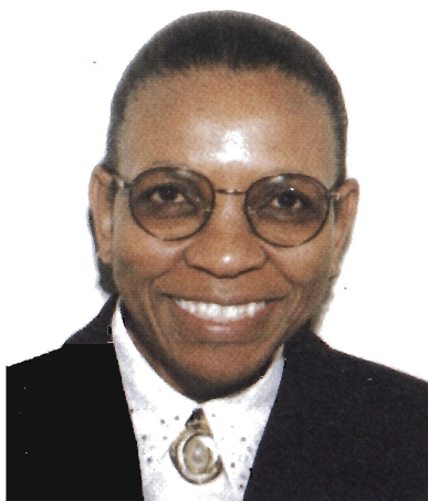
Judge Thokozile Masipa

T hokozile Matilda Masipa has been appointed as a judge of the Transvaal Provincial Division from 1