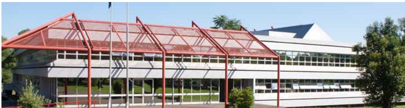
Eastern Cape Mthatha High Court