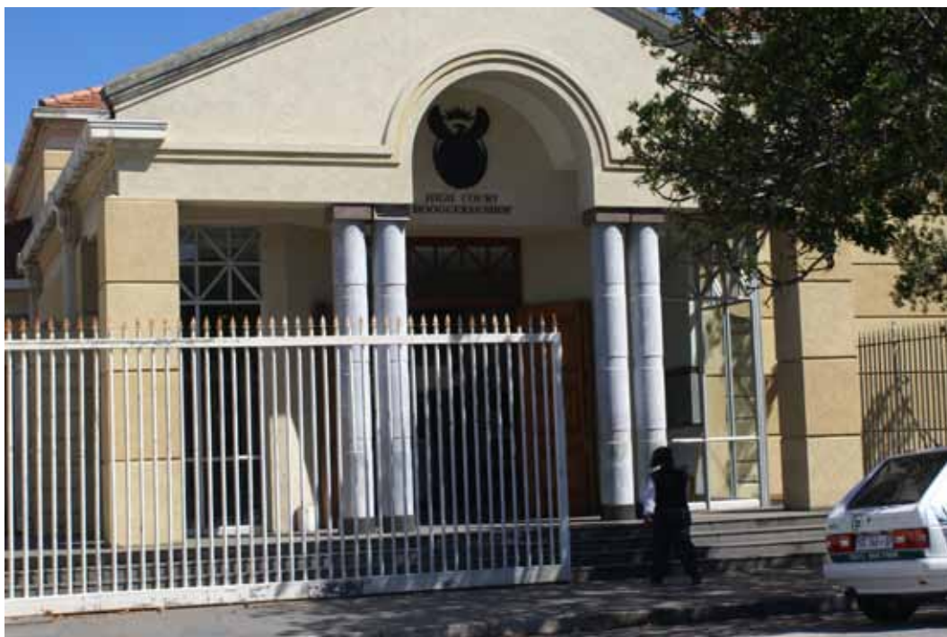
The High Court of the Eastern Cape in Port Elizabeth

* See pages 50-52 for articles on the Mthatha and Bhisho High Courts