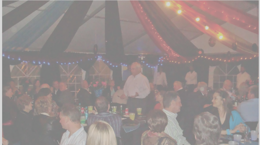
The scene at Dup de Bruyn SC's birthday party.