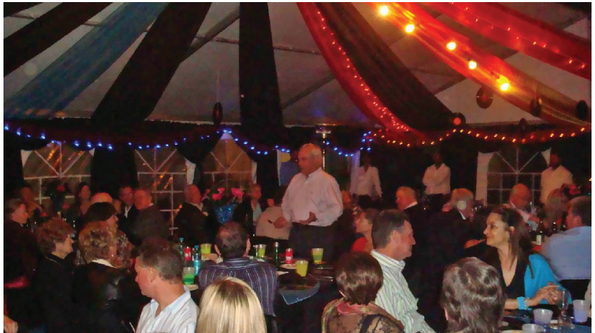
The scene at Dup de Bruyn SC's birthday party.