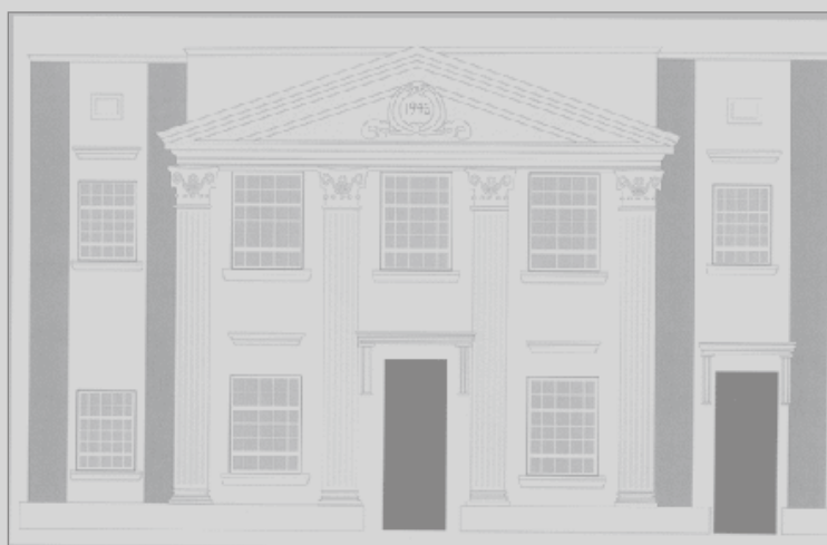
Sketch of Equity House Chambers.