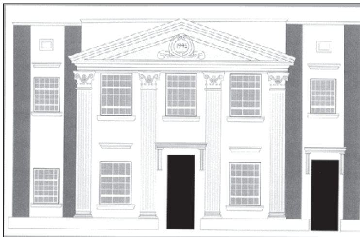
Sketch of Equity House Chambers.