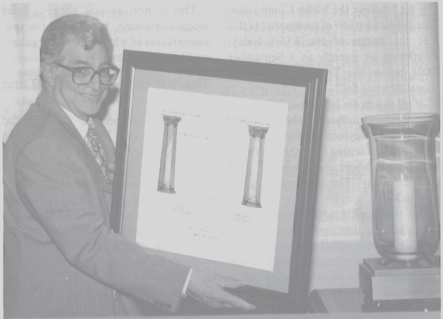
Justice Arthur Chaskalson, president of the Constitutional Court, and the second recipient of the Sydney and Felicia Kentridge Award for Service to the Law, at the handing over ceremony. The Kentridge award was set up by the GCB in 2000. The first award was bestowed posthumously on the late Chief Justice Ismail Mahomed.