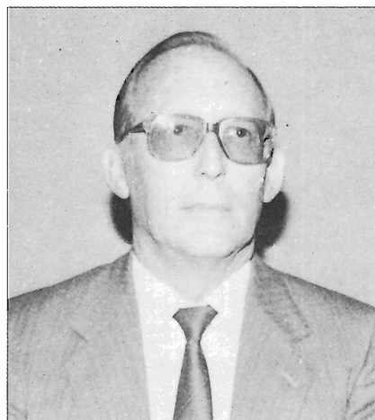
RG Comrie SC

Twenty-six new advocates from the Republic of South Africa were also admitted to the Supreme Court of Bophuthatswana during the past year. We welcome this growth, as these and other advocates render an invaluable service in assisting local members to cope especially with the Legal Aid criminal cases.